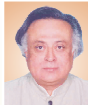
Shri Jairam Ramesh Hon'ble Union Minister of State for Commerce & Power

Event Theme : Imagining for a 'Brave new world'